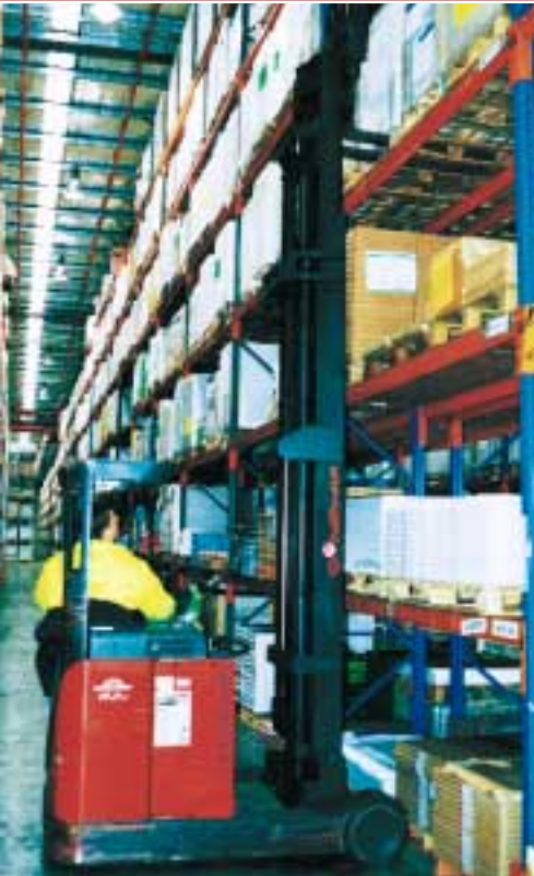
Left: PaperlinX’s Linde fleet includes narrow aisle reach trucks and gas forklifts fitted with clamps for paper roll handling.